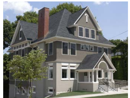
The FLI at 601 S. Main St. on the campus of HWS.

The Finger Lakes Institute (FLI) recently received a $3 million 2:1 challenge grant from the Andrew F. Mellon Foundation to endow a professorship and science coordinator, a post-doctoral research position, research funds, summer research student funding, and scholarships for minority student participation in the Environmental Studies Summer Youth Institute. FLI is still seeking funds for the $2 million match stipulated by the award. Donations are matched by Mellon as they arrive on campus up to the pledged $1 Million from Mellon. This most recent commitment follows a progression of previous awards from the Andrew F. Mellon and other foundations as well as New York State and the Federal Government to create and maintain the Finger Lakes Institute on the campus of Hobart and William Smith Colleges.