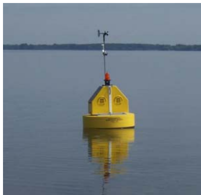
The Seneca Lake water quality and meteorological monitoring buoy. Data available at: http://fli-data.hws.edu/clarkpt/conditions.php

nutrients on these lakes. More recently, Kerry O'Neill (WS'09) analyzed the available limnological data and concluded that land use, particularly runoff of nutrients from agricultural land modulated by the intensity, seasonal timing and quantity of rain, and nutrient loading from septic systems and municipal wastewater treatment facilities have a detrimental impact on water quality in the Finger Lakes. The publications/reports from these efforts are listed in a subsequent section of the newsletter and can be found on my web site: ( http://people.hws.edu/halfman/ ).