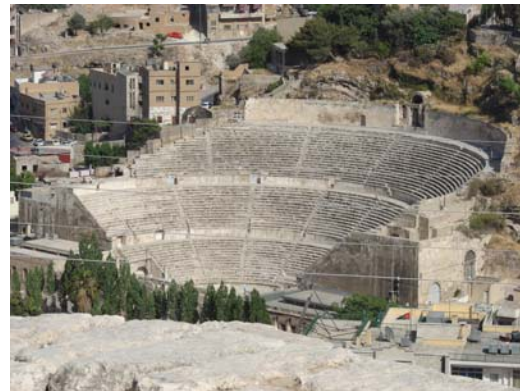
Ancient ruins rise amid the bustle of the modern city of Amman