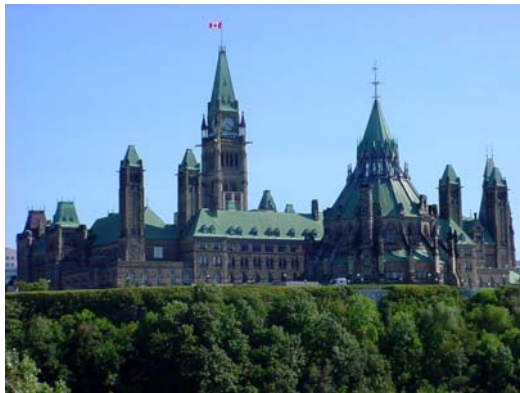
Parliament in Ottawa