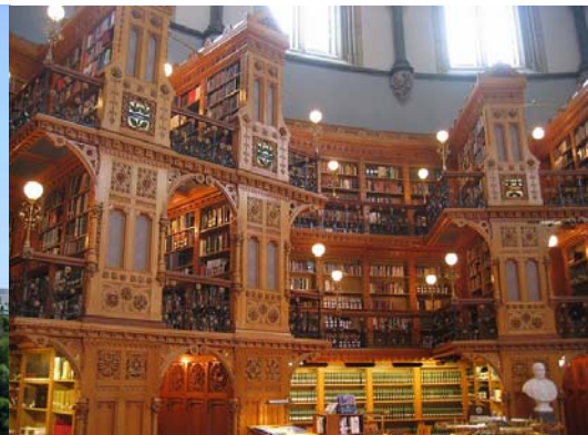
Parliament's amazing library