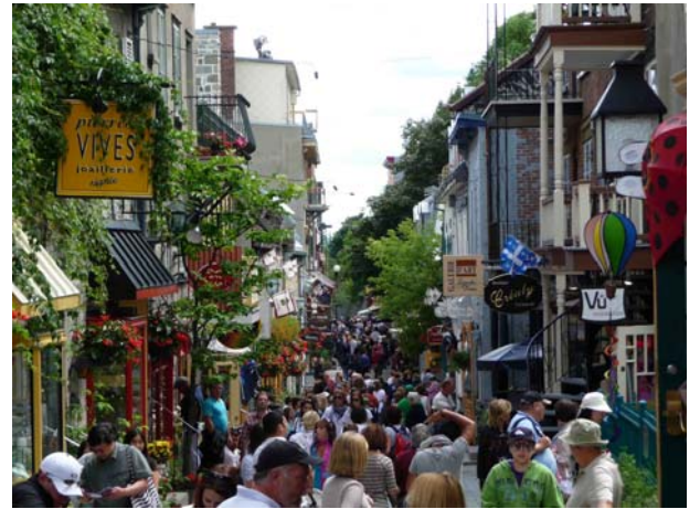
European-style shopping street

Earn one HWS credit on this 3-week program and experience all that the “Europe of the North” has to offer. While there will be some time spent in a classroom, the main classrooms will be the cities themselves (Ottawa, Montreal and Québec City) as you explore them with two HWS Faculty members, talking to specialists about multiculturalism and immigration, and visiting sites like the Parliament in Ottawa, the National Assembly of Québec, and various history and art museums in all three cities.