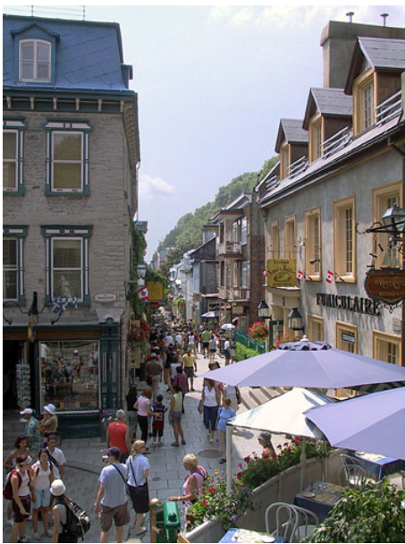
Old Québec City

The winding, cobblestoned streets of old Québec, the grand architecture, the charming outdoor cafés, the French restaurants and the beautiful French language you hear all around you will make you feel like you're in Europe – but it's all right here in North America! This truly is a different culture from our own and from the rest of Canada.