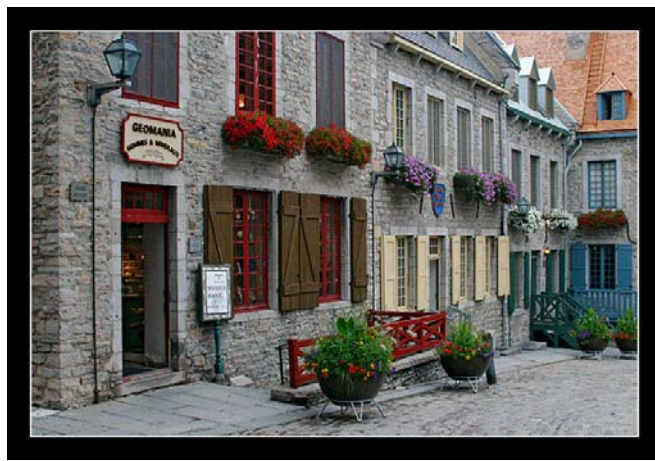
Flowers and cobblestones, Québec City