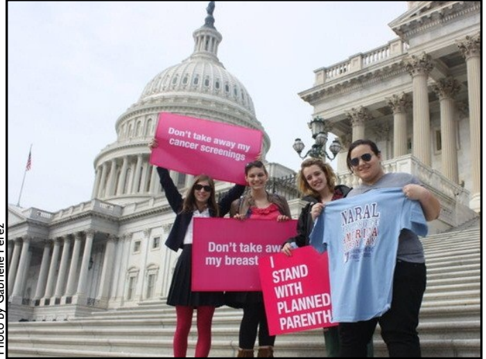
April 7, 2011: Women's Studies students March on Washington during the Stand Up for Women's Health rally in support of Planned Parenthood during the recent funding debates.