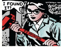
Event Poster from the seminar's first public forum

Tuesday, March 29, 2011 6PM SCANDLING CENTER